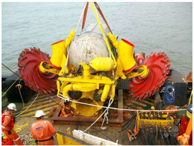
COMBO PTM onboard of Martin-P Vessel