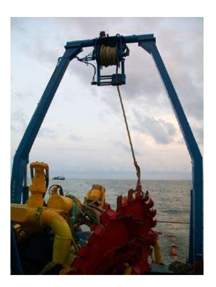
Rossana Trimaran shallow water barge equipped with A-frame