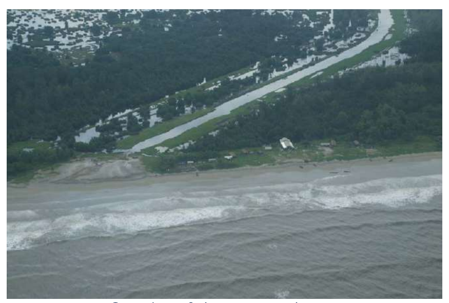
Overview of shore approach area

CHEVRON NIGERIA LIMITED (CNL) awarded West African Ventures Limited (WAV) the Contract of continuing with the outstanding work scope to complete the 24" x 23.62km EGTL – PLEM Export pipeline system.